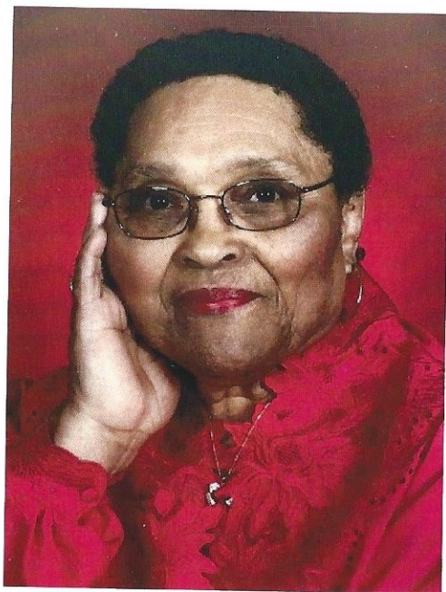
In Loving Memory Of Our Mother