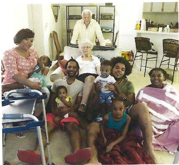
Remembering Mother with Love