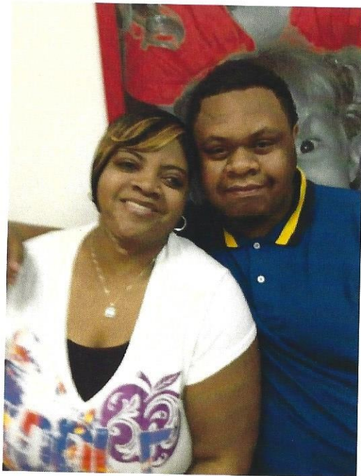
In Loving Memory Of Mother

If roses grow in Heaven, Lord pick a bunch for me. Place them in my Mother's arms and tell her they're from me. Tell her I love her and miss her, and when she turns to smile, place a kiss upon her cheek and hold her for a while. Because remembering her is easy, I do it every day, but there's an ache within my heart that will never go away.