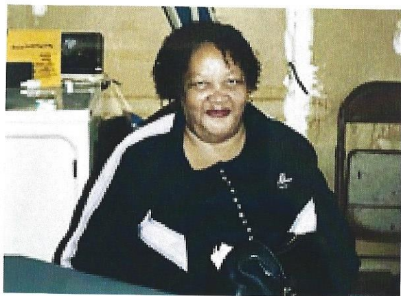
In Loving Memory Her Family

How is it that I never saw your wings when you were here with me? When you closed your eyes and soared to the Heavens, I could hear the faint flutter of your wings as you left. Your body no longer on this side, your spirit here eternally. I see your halo shine, I close my eyes and see the multi-colored wings surround me in my saddest moments and my happiest times. Mother my angel, God has given you your assignment. Always my mother, forever my angel. You fly into my dreams and when I am asleep I feel your wings brush against my face wiping away the tears I shed since I can no longer hold you in my arms but in my heart. You earned those wings dear mother and you will always be to me an angel eternal.