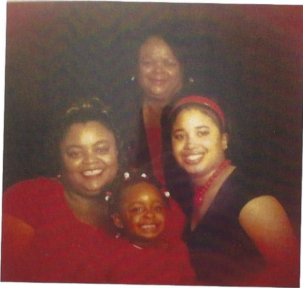
In Loving Memory Her Girls