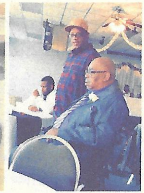
Processional & Viewing